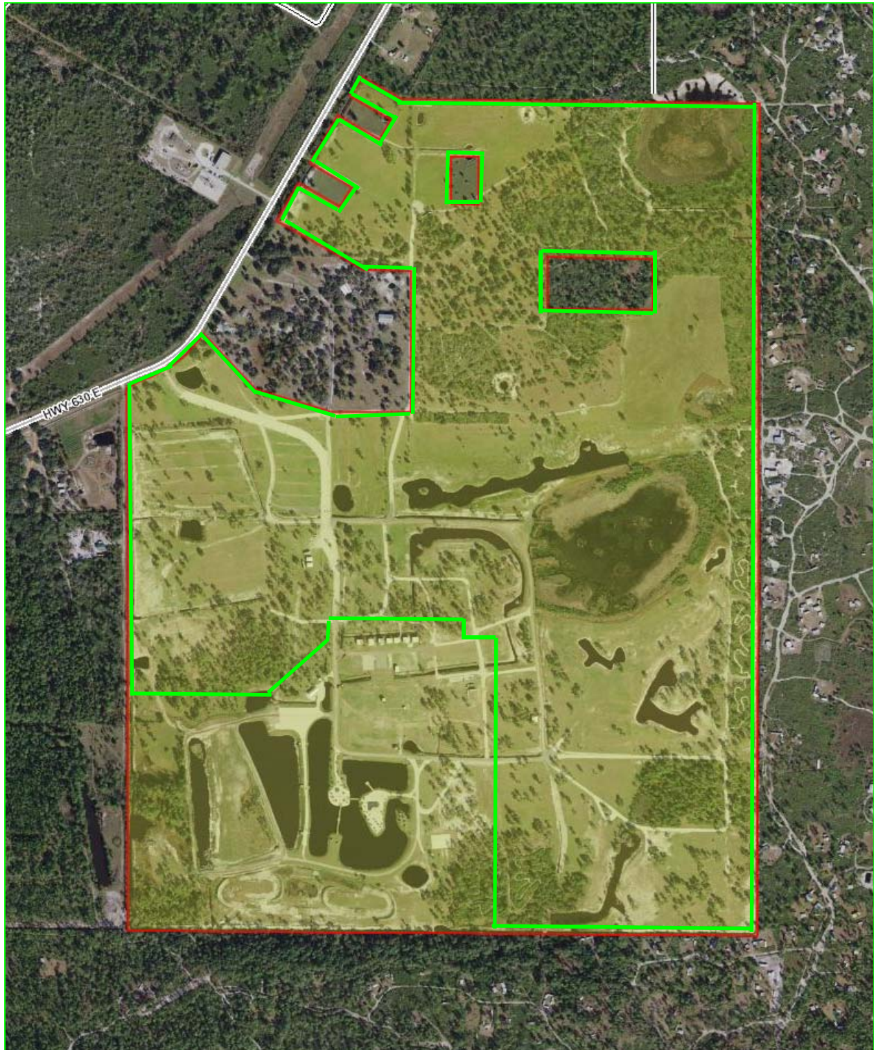
AERIAL OF SITE